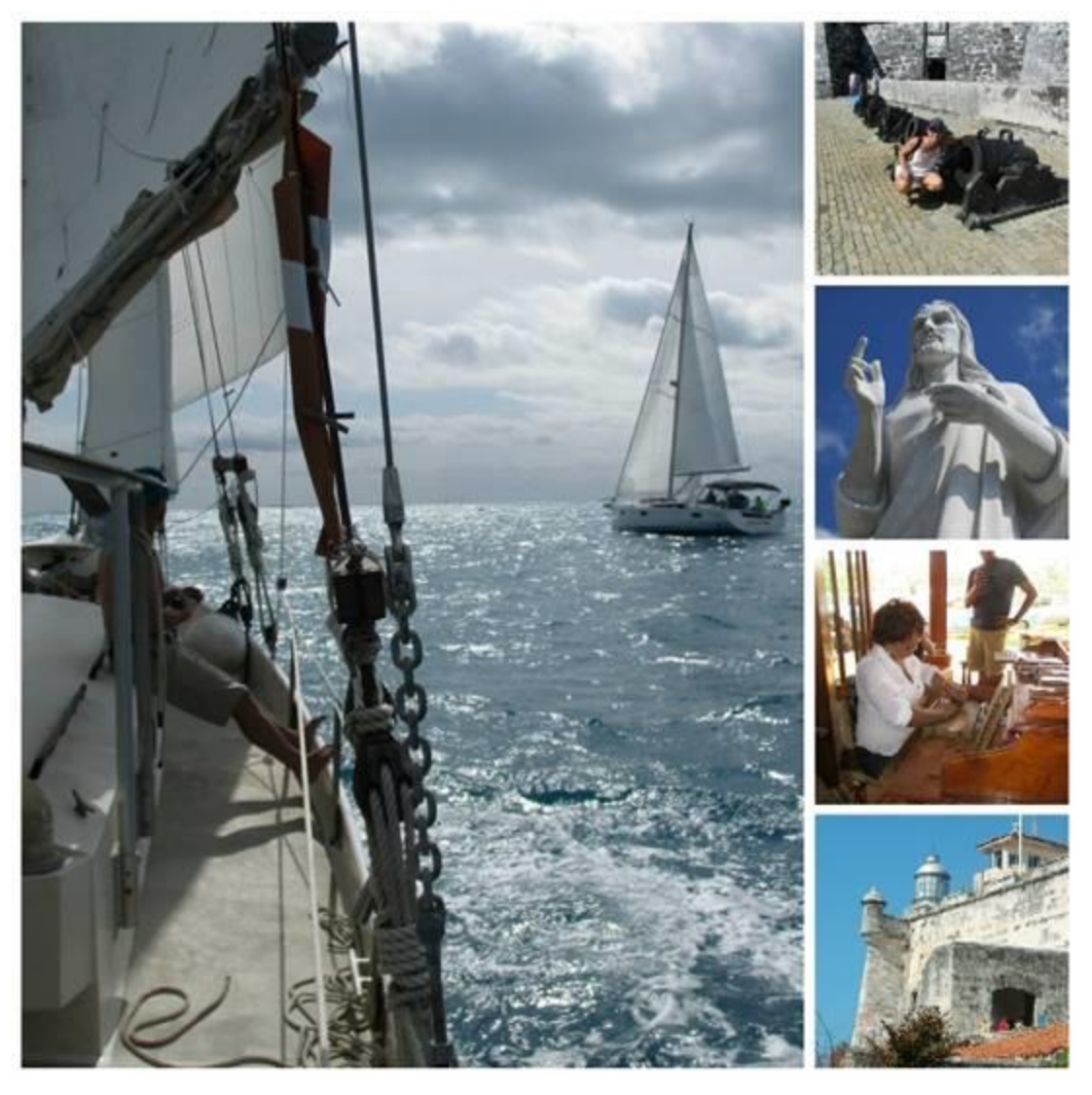
After sailing from Key West to Cuba, competitors can expect a rich cultural exchange with social functions and time off for sightseeing.